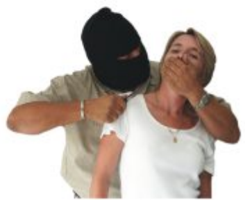
Any Hi-Jack (ZX60)