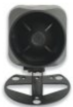
Siren output (ZX60)