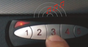
ZX40-KP Personal Identification Keypad with built in beeper

The ZX40-KP is SAIA Insurance Approved, is very affordable and can be installed into most vehicles. Contact your local Sanji approved fitment centre for further details.