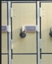
Key theft from gym locker

An auto back light facility illuminates the keypad at night making it very easy for the driver to enter his pin code. A secure service mode is provided for vehicle service.