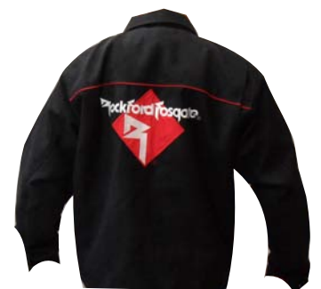
JACKET - BACK